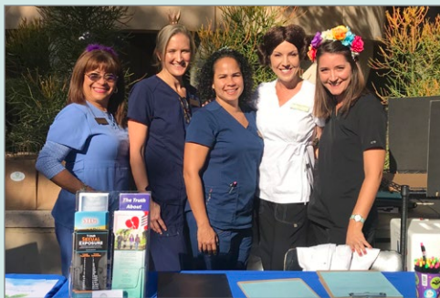
Our medical team at the UTSA Health Fair

Our medical team attended the UTSA Health Fair this October seeing a record number of clients for STD/STI testing and treatment. This annual event provides an opportunity for us to help minimize the spread of STI/STDs, meet and serve those most at risk for unintended pregnancies, and build trust with young adults in the area community.