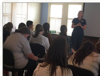
Students Visit HCPCC

Our area schools have invited us to help teach a portion of their health and wellness curriculum. Some students come to our location for a tour, other teachers invite us into the classroom. We